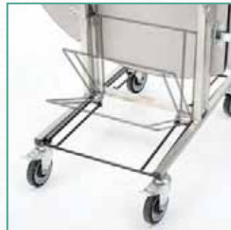
With Drop Shelf (WDS)