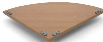
AFT SEG 72° segment for modular tables 9.8kg

Also available (not shown): Bench 1800 x 285 x 460 mm 8.0kg