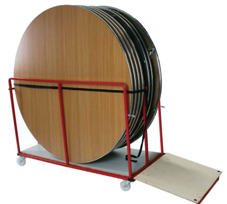
TT 180 1905 x 800 x 1185 mm