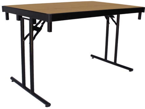
AFTT 2275 2200 x 750 mm 12.0kg AFTT 1875 1800 x 750 mm 10.9kg AFTT 1575 1500 x 750 mm 9.8kg