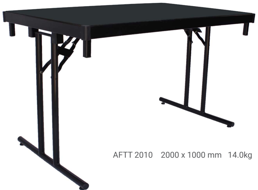
AFTT 2010 2000 x 1000 mm 14.0kg

All trolleys have 4 swivel wheels (2 lockable)