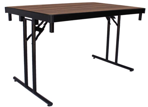
AFTT 1845 1800 x 450 mm 9.7kg AFTT 1645 1600 x 450 mm 8.5kg