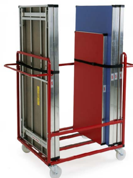
TT MIDI 900 x 825 x 1185 mm

Holds up to 25 rectangular tables Max. 10 x 1500 mm Ø round tables Max. 9 x 1200 mm Ø round tables