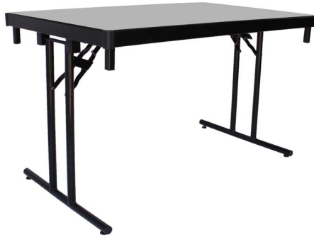
AFTT 1860 1800 x 600 mm 10.2kg AFTT 1560 1500 x 600 mm 9.2kg