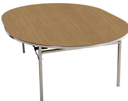
AFT 2015 2000 x 1500 mm Oval 19.6kg