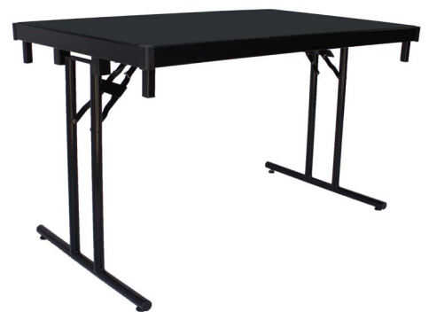
Alu-Lite Table with T-Leg and black frame