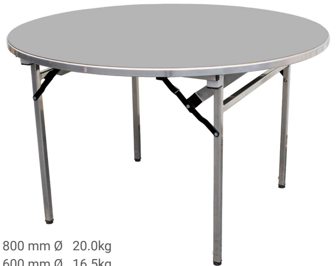
Table trollies for round and trestle tables also available (see next page)

Standard height for all Alu-Lite Tables is 735mm