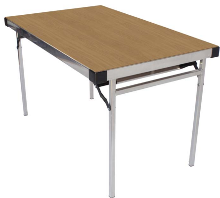
Alu-Lite Table with Standard Leg and natural frame

Whether you need folding tables for meetings or banqueting or you need the flexibility to handle both in your venue, the Alu-Lite table is the perfect solution. Alu-Lite folding tables are lightweight and strong, stable and easy to use.